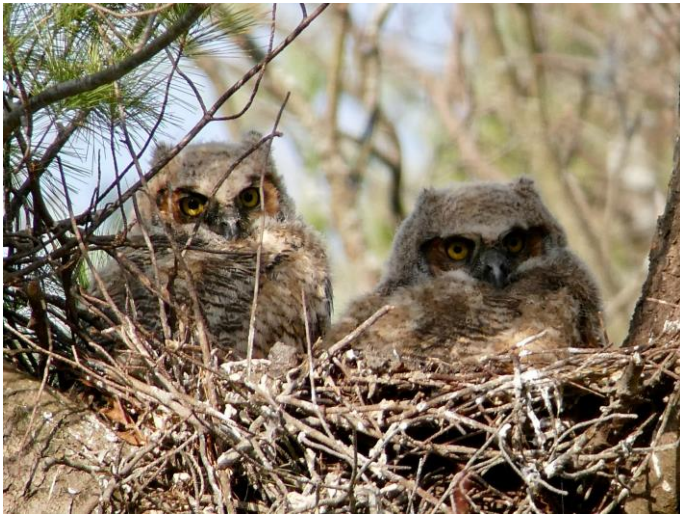
Great Horned Owl Nest with Young (NY)