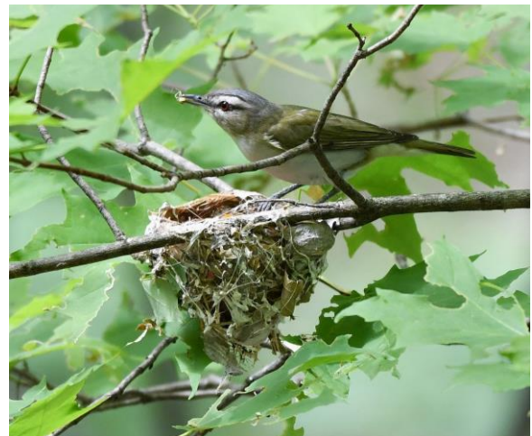
Red-eyed Vireo Carrying Food (CF)