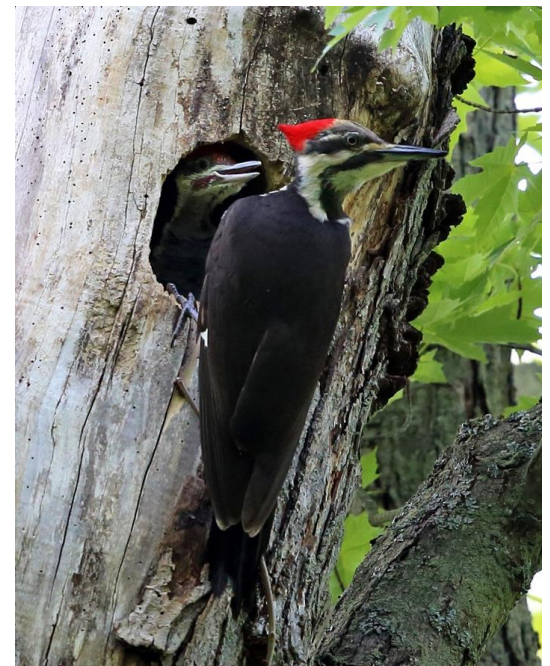
Pileated Woodpecker and Nest with Young (NY)

Get started and learn more at ebird.org/atlasny . Join the atlas community on Facebook @nybba3 and Instagram @nybbaiii and help spread the word!