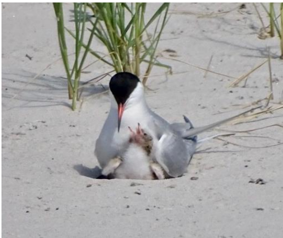
Common Tern and recently Fledged Young (FL)