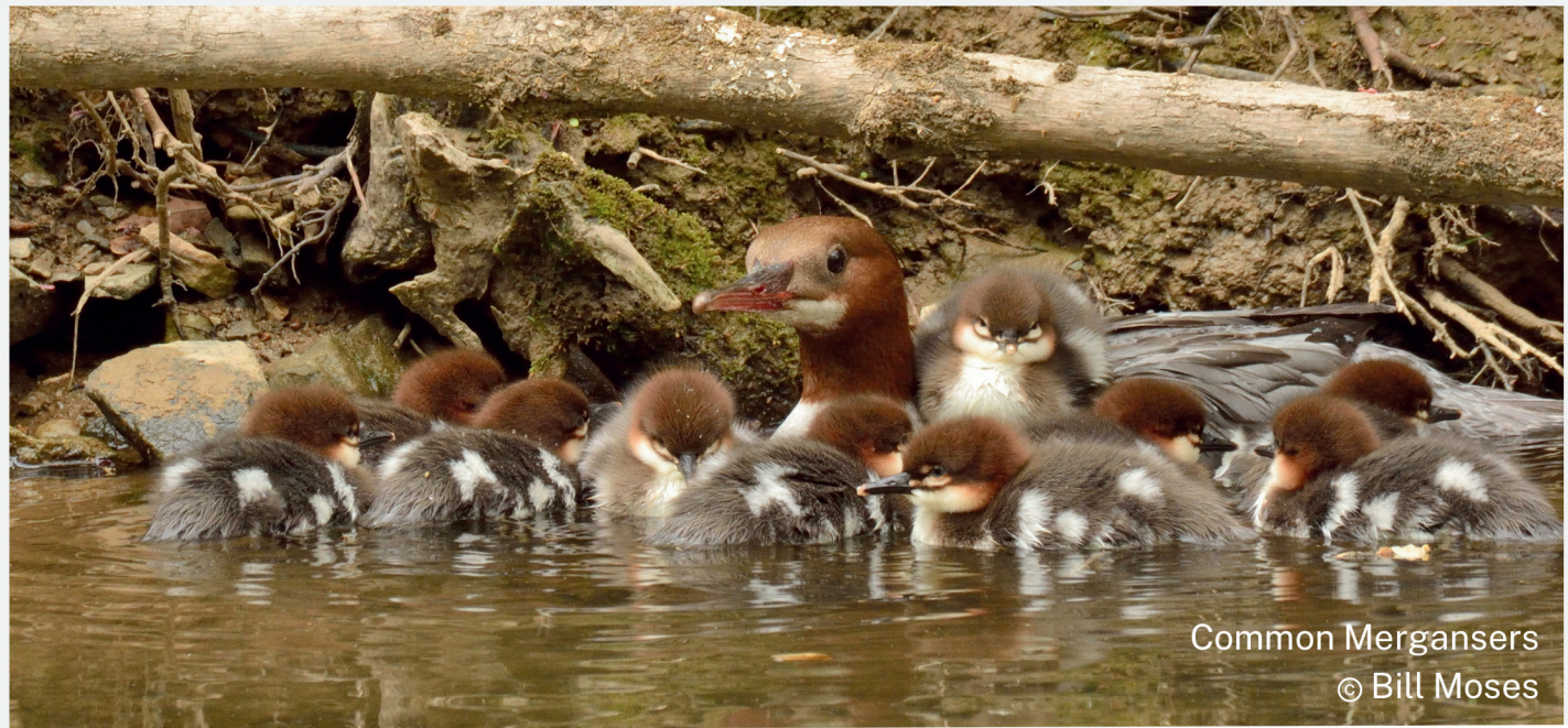
Common Mergansers