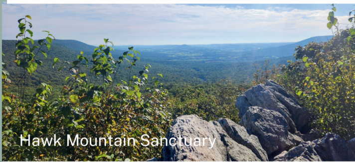
Hawk Mountain Sanctuary